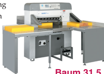
Baum 31.5 Model A2 with Air Transfer Tables