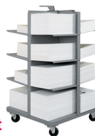
Baum Q4 QuadCart