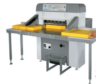
Baumcut 26.4 shown with optional side air tables