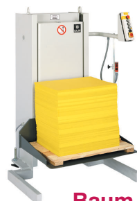
Baum L2 Stack Lift