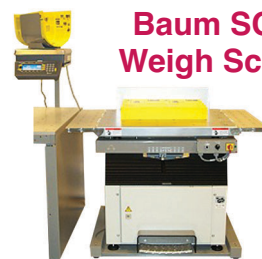
Baum SC2 Weigh Scale