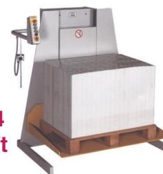
Baum L4 Stack Lift