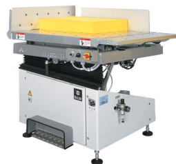
Baum B2 Jogger