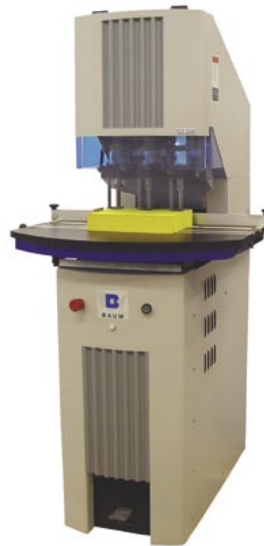
D3 Stationary Table