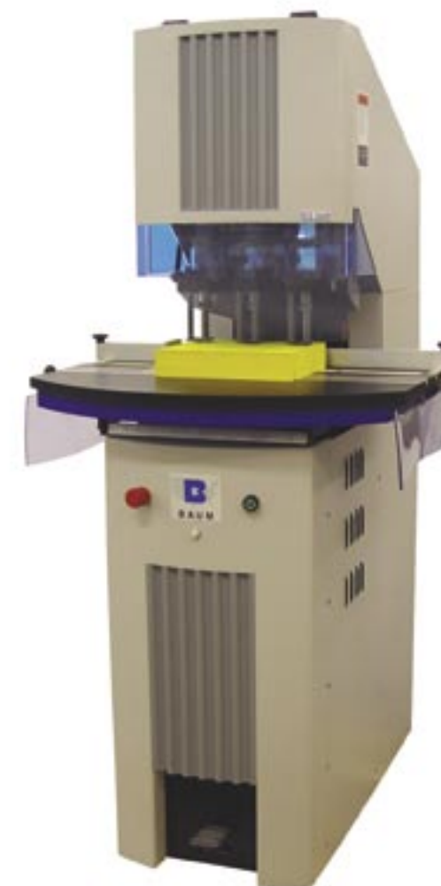
D3 Moveable Table