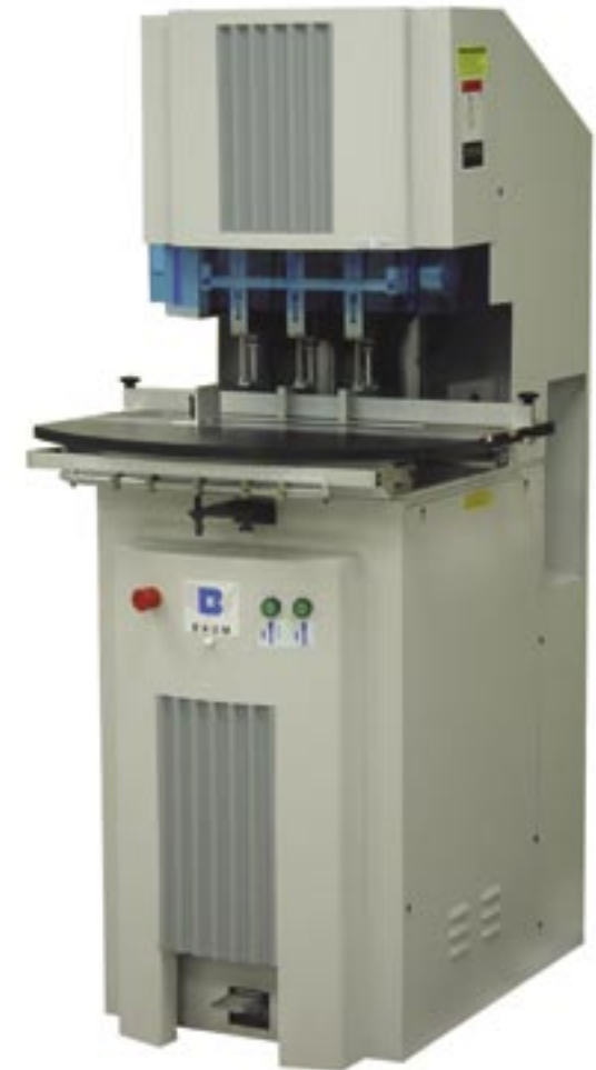
D5 MT Moveable Table

By drilling in multiple steps, the moveable table option allows you to efficiently increase the number of holes drilled. It also increases the maximum center-to-center distance of the heads to 23.13 inches [60cm], and reduces the minimum distance to .38" [9.7mm] using adjustable stops. The table easily moves from left to right and back again, with no paper shifting. Spring tension maintains the position for drilling.