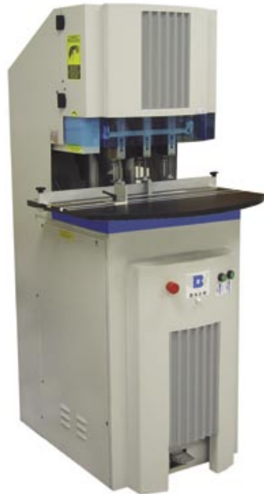
D5 ST Stationary Table